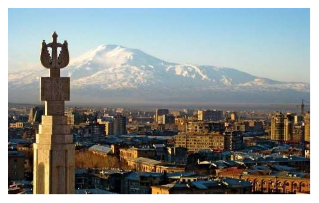
May 16-19, 2024, Yerevan, Armenia